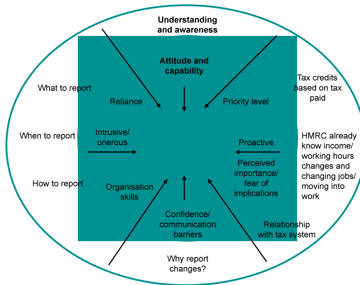
Diagram 3: Factors driving reporting decisions

It appears then that both types of factors combine to form the decision to report on time, late or not at all. That is, decisions to report are driven by levels of understanding as well as levels of willingness and capability to report. The following diagram shows how knowledge and competence factors might interact with each other to form a reporting decision.